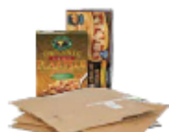
Cardboard & Boxboard